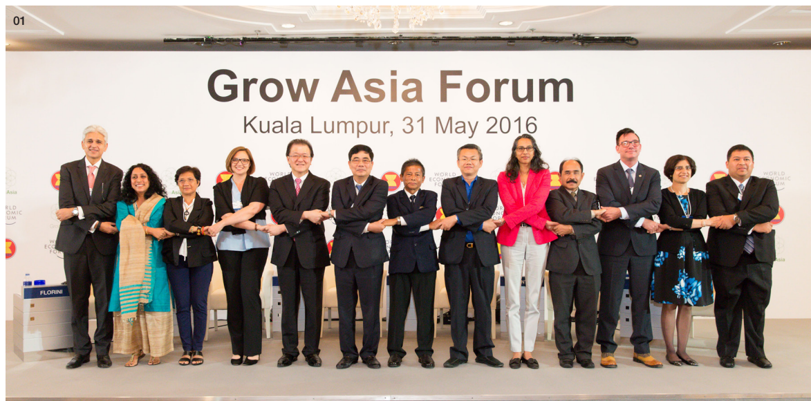
01: Leaders at the Grow Asia Forum 2016

The minister underlined the complementary role that trade can play in achieving food security, highlighting that trade can simultaneously enhance a nation's competitiveness and nutritional diversity, increase incomes and stimulate economic growth.