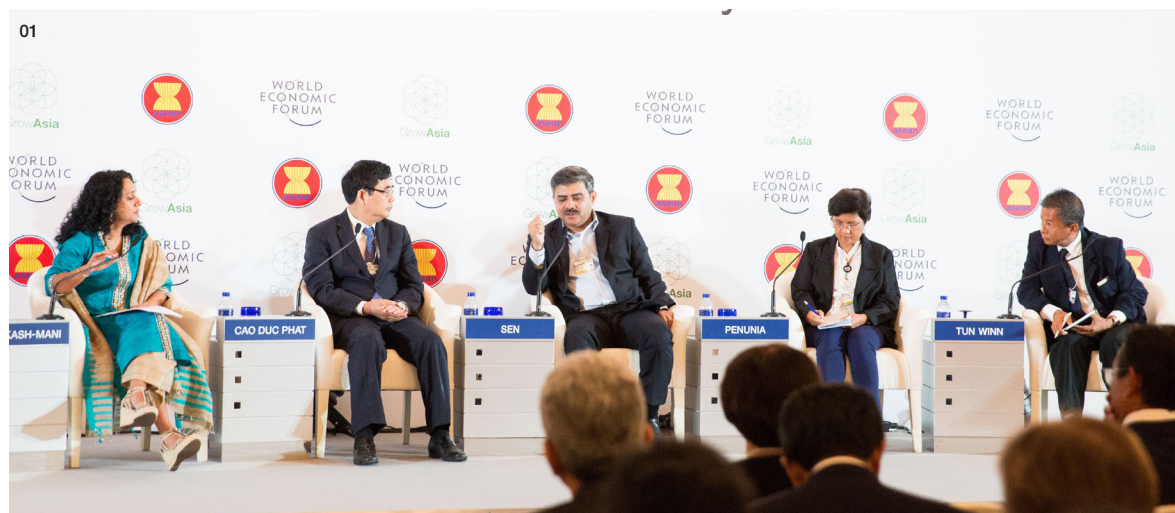
01: Panelists at the opening plenary

She also recommended that Grow Asia continue its efforts to replicate the Grow Asia partnership steering committee model at the local level within each country, and work towards a strong monitoring and evaluation process to measure the results of the partnership initiatives as well as their contribution evaluation process to measure the results of the partnership initiatives as well as their contribution to the 10-20-20 goal.